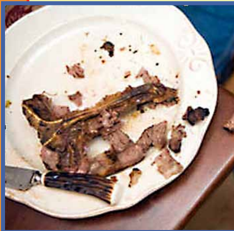
Table scraps often contain meat fat that a human didn't eat and bones. Both are dangerous for dogs. Fat trimmed from meat, both cooked and uncooked, can cause pancreatitis in dogs. And, although it seems natural to give a dog a bone, a dog can choke on it. Bones can also splinter and cause an obstruction or lacerations of your dog's digestive system.