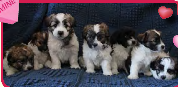
PUPPIES PUPPIES PUPPIES !