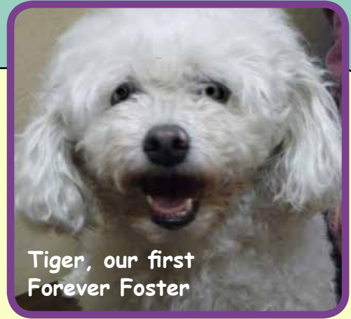
Tiger, our first Forever Foster

If you would like your name to appear on our website and be updated on a furkid's progress, let us know.