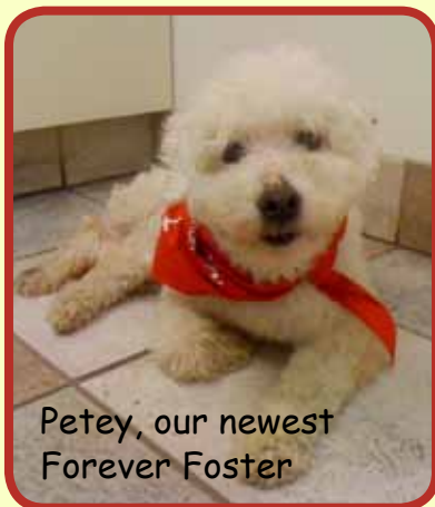
Petey, our newest Forever Foster

http://www.bichonfurkids.org/donations and specify Forever Foster under Purpose.