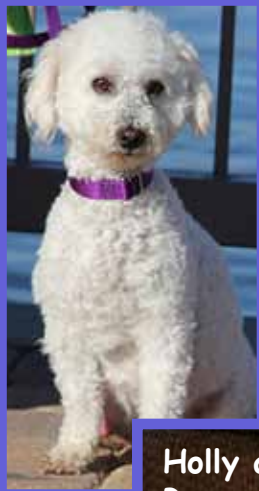
Holly and her Puppy Pile Day 3

Interested adopters can apply at www.bichonfurkids.org/Applications and can meet the puppies in February for adoption in early March.