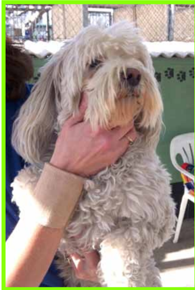
"Fonzie" at the shelter...