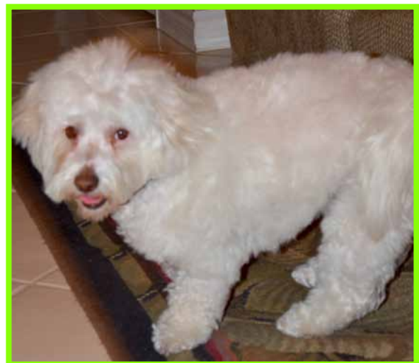
... now "Dexter" ... at his forever home