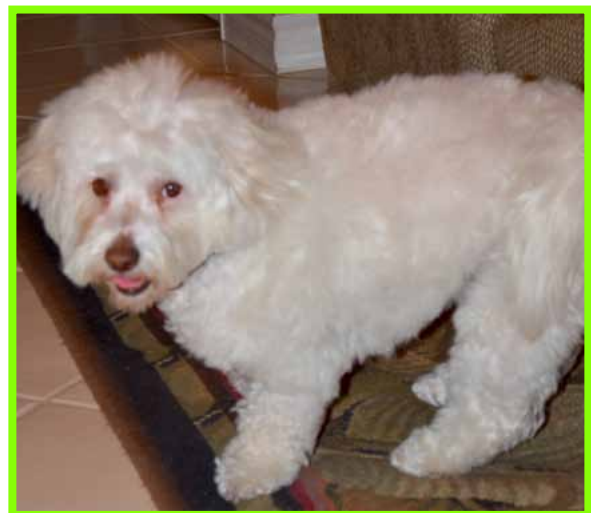
... now "Dexter" ... at his forever home